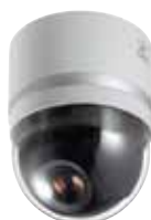
Surveillance camera systems