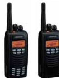
Emergency and office broadcasting equipment