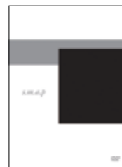
SMAP 2008 super modern artistic performance tour/ SMAP (DVD: VIBL-501 to 503)