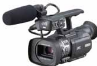
Pro HD Camcorders