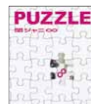
PUZZLE (regular version)/ Kan-Johnny ∞ (CD: TECL-8008)