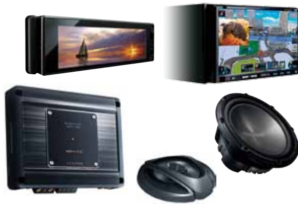
Car audio and AV all-in-one navigation